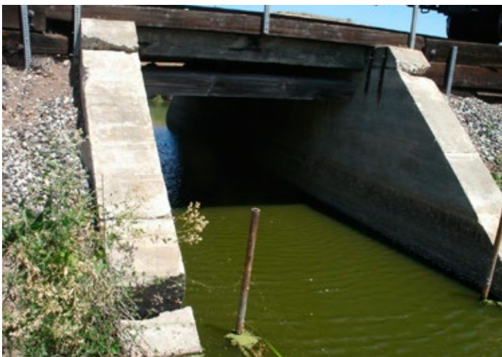
This UPRR bridge will be replaced as part of an effort to improve the wildlife habitat in McNabney Marsh.

One critical step in this process of restoring the marsh is to replace a Union Pacific Railroad (UPRR) Bridge over Peyton Slough. This bridge creates a bottleneck for water as it leaves the marsh during low tides. Water becomes trapped in McNabney Marsh, leading to stagnation and water quality issues.